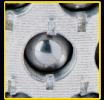
OLD TWO-POINT STAKE